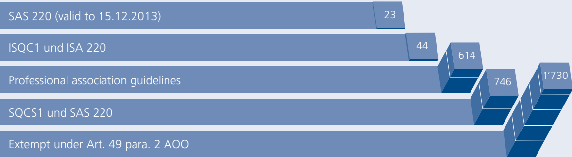
Figure 9 Information from audit firms on the system of internal quality assurance applied (status: 31 December 2014)

The FAOA has analysed the number of licensed audit firms that performed ordinary audits during the calendar